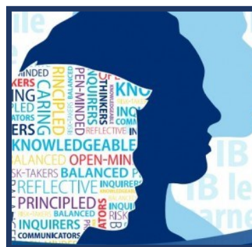
Image adapted from IBO: https://www.ibo.org/contentassets/fd82f70643ef4086b7d3f292cc214962/learner-profile-en.pdf

Throughout the Student-led Conference and in the time preparing through reflection, students demonstrate the IB profile of Communicator by demonstrating that they can express themselves confidently and creatively.